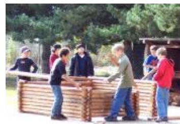
At Philip Foster Farm, students learned how pioneers constructed log cabins.

In keeping with the spirit for both of the holidays, our class will be participating in a Food Drive for families in need, and collecting toys for local children.