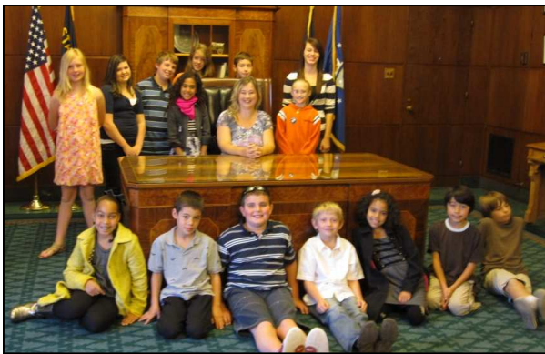
Our trip to the State Capitol was fascinating!

Our class has been busy this fall! While the older students are studying American History and the Story of Mankind , the 4th thru 6th graders are continuing on with the Oregon unit, the emphasis this time being on the Oregon Trail. We will also be having an Energy Conservation assembly and going on a field trip to Do Jump! (a physical theater performance combining acrobatics, trapeze tricks, dance, etc.). A group of Native American dancers will be performing for us, as will be the Trinity High School choir.